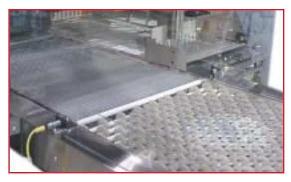
Pattern Staging and Loading Area